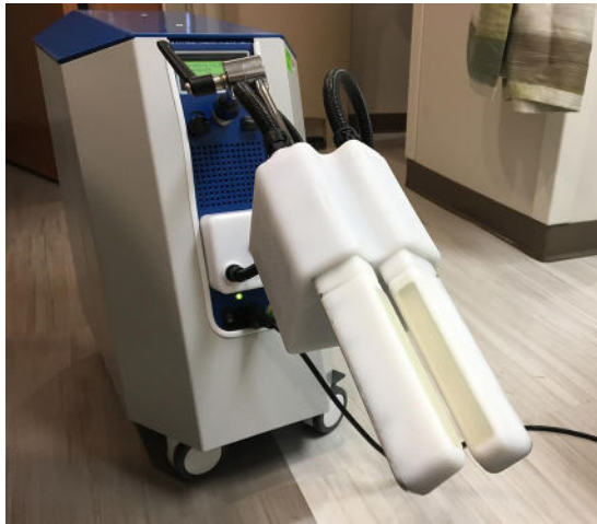
Fig. 1 – The MoreNova shockwave generator used for this trial.